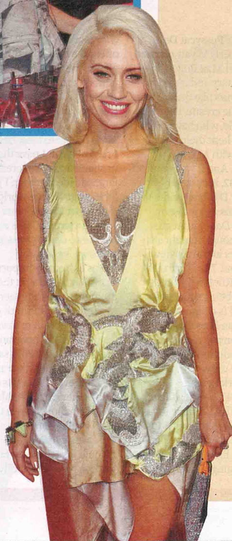
Top: Doing her first ever DJ-ing set in Dublin in April Right: Showing off her style