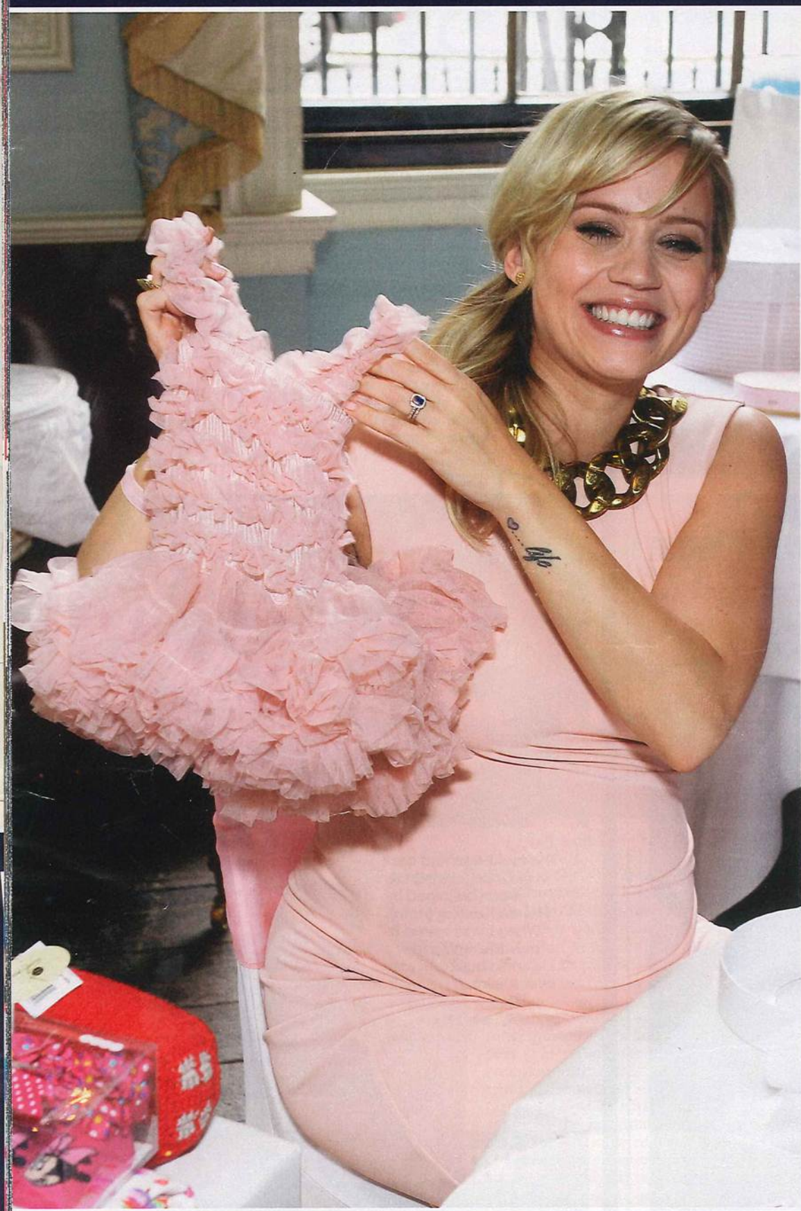
An excited Kimberly Wyatt opens her baby shower gifts, some of which are unashamedly girly (above). The former Pussycat Doll restrained her own instinct to think pink when it came to decorating the nursery: "We've kept it fairly neutral with a woodland theme"

W ith just weeks to go until her baby is due, Kimberly Wyatt could be forgiven for wanting to just sit at home with her feet up. But instead, as the former Pussycat Doll welcomes friends and family to her baby shower at Home House private members' club in London, she looks the ultimate glamorous mummy-to-be, wearing five-inch heels, a body-fitting dress and fabulous peach feather shrug.