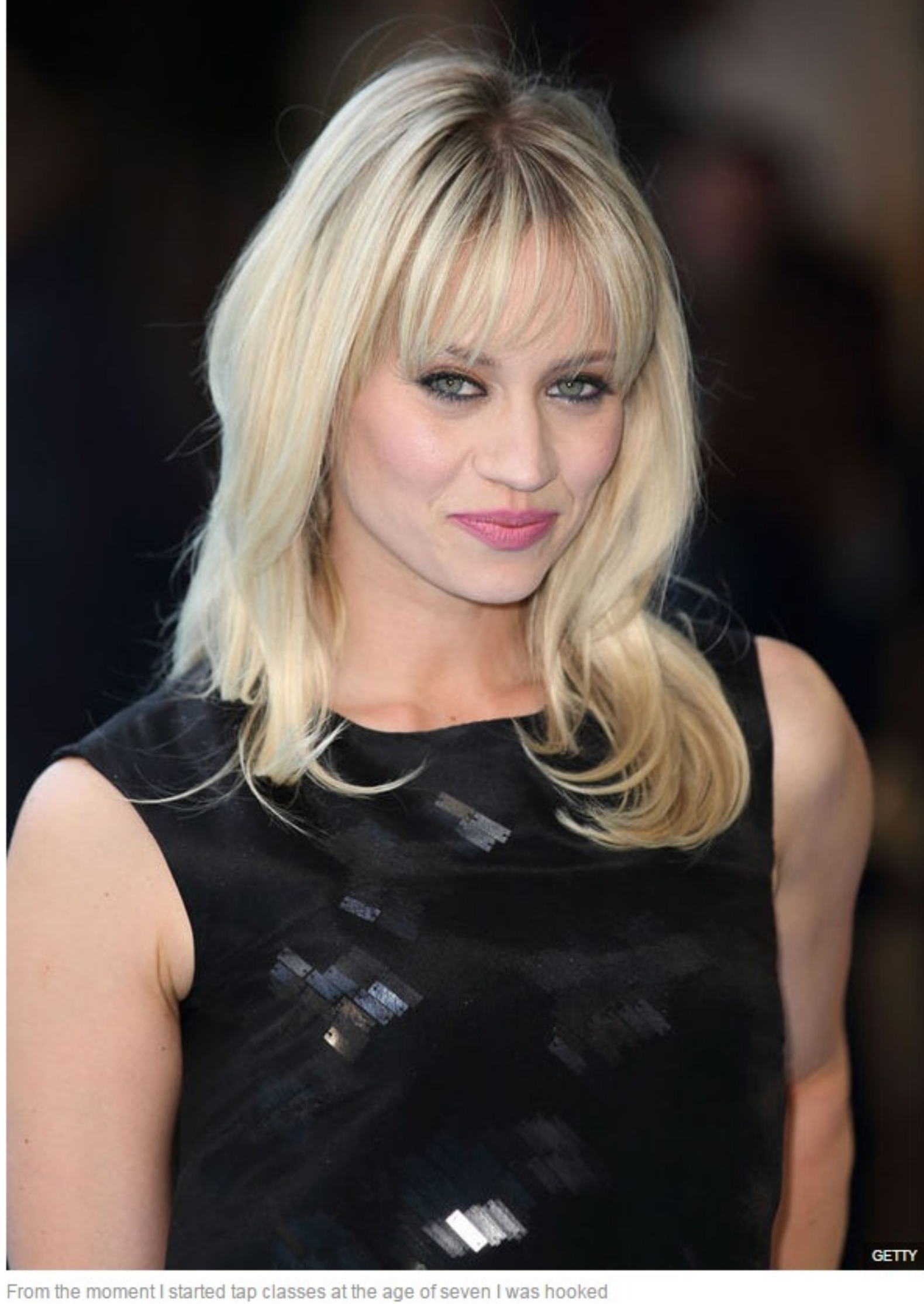
From the moment I started tap classes at the age of seven I was hooked