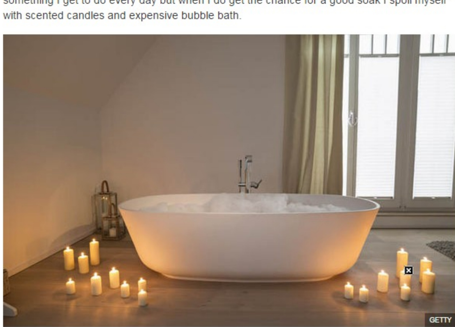
I like to relaxing in a deliciously hot bubble bath

As a busy working mum I think it's important for me to take a little time out for myself and the way I like to do that is by relaxing in a deliciously hot bubble bath. Unfortunately it is not something I get to do every day but when I do get the chance for a good soak I spoil myself with scented candles and expensive bubble bath.