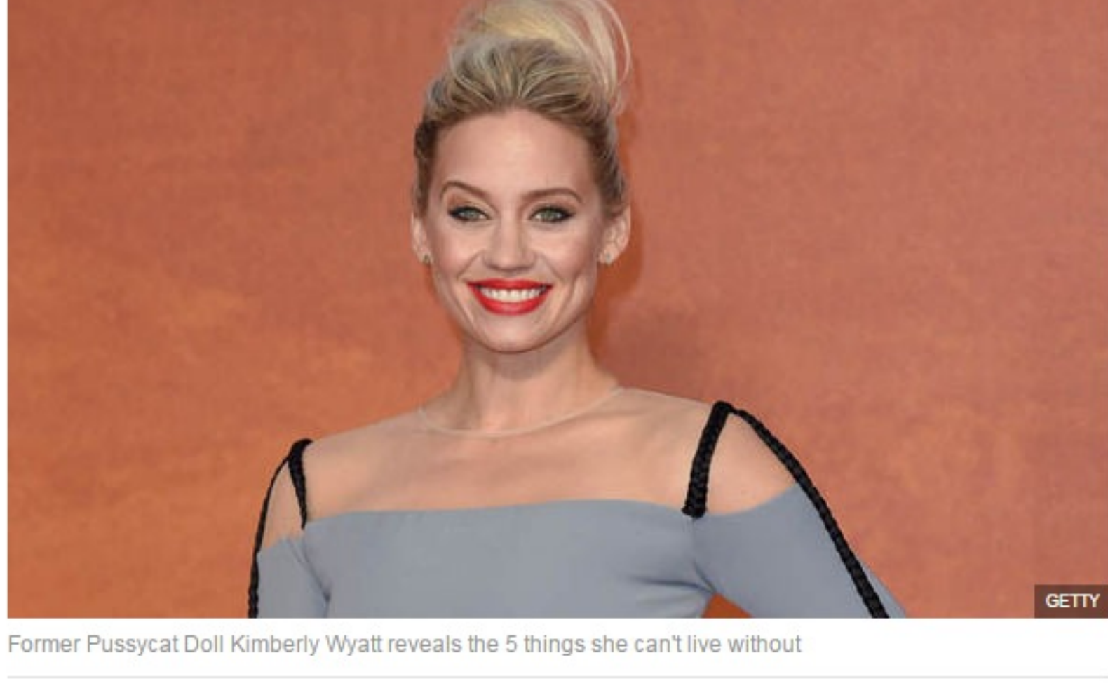
Former Pussycat Doll Kimberly Wyatt reveals the 5 things she can't live without