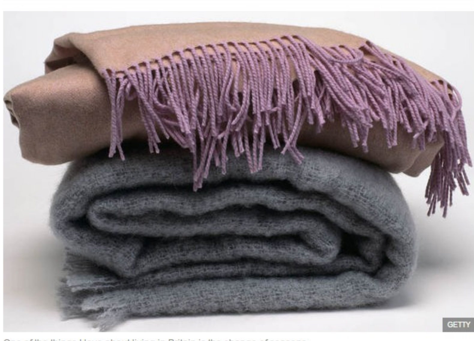
One of the things I love about living in Britain is the change of seasons

I know some of my friends like to chat on the phone while they're in the bath but for me it is all about peace and solitude. By the time I re-emerge I am miraculously calm and energised.